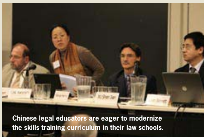
Chinese legal educators are eager to modernize the skills training curriculum in their law schools.