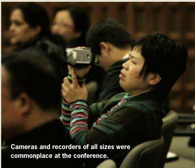
Cameras and recorders of all sizes were commonplace at the conference.