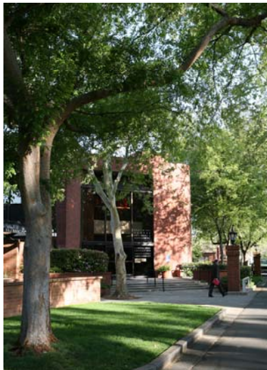
Pacific McGeorge Graduate and International Programs is housed on the first floor of Northwest Hall in the north-west corner of the campus.

Eleven call boxes are placed throughout the Pacific McGeorge campus to allow students immediate contact with Public Safety officers in the event of a police, fire, or medical emergency. If you are in need of emergency assistance when away from campus dial 911 . This number can be used to call for help anywhere in the United States.